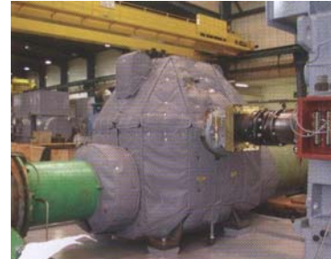
16" x 18" Centrifugal Pump Design: LT450A-TT-1.5" Thick 6.0dBA Reduction

Blanket construction shall be a double sewn lock stitch with a minimum of 7 stitches per inch. Raw jacket edges will have a tri-fold PTFE Teflon® cloth binding. No raw cut jacket edge will be exposed. Stitching will be done with pure Teflon® thread.