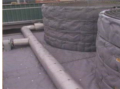
Cooling Tower Design: LT450A-TT-1.5" Thick 10 dBA Reduction